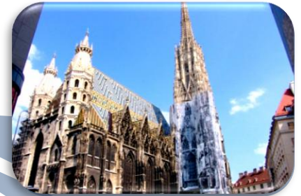
Center of Vienna