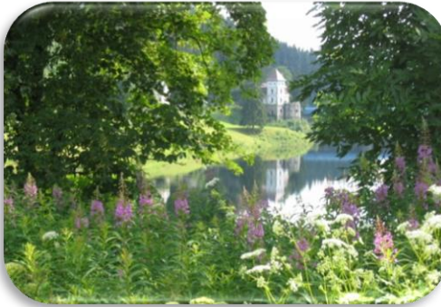
2007: Brussels- Istanbul