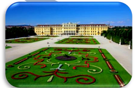
Schön Brunn Palace