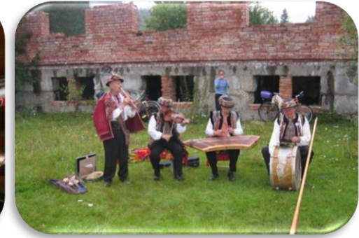
2005: Klaipeda - Odessa