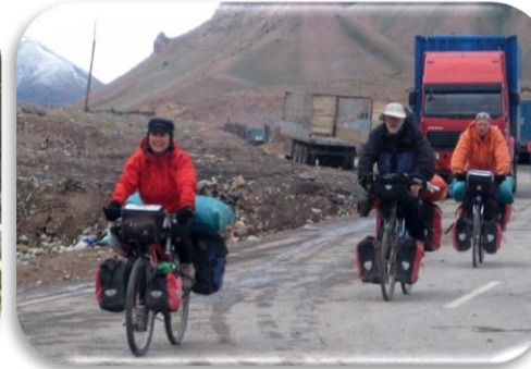
2008: Olympia - Peking