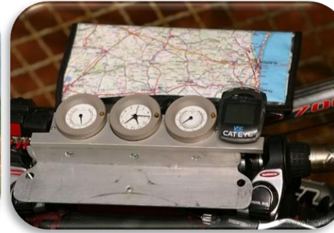
2004: North cap - Olympia