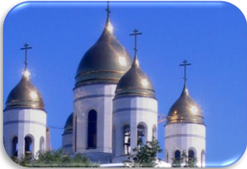
2006: Around North Sea