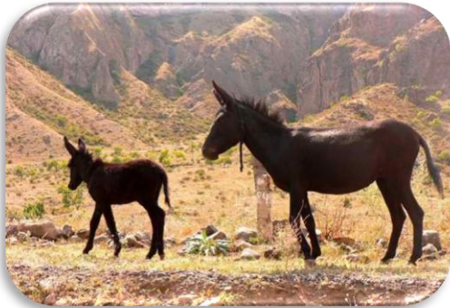
2010: Around Mount Ararat