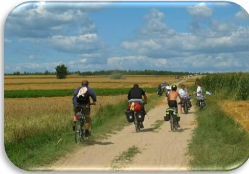
2003: Warsaw - Vilnius