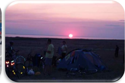
2009: Odessa - Odessa